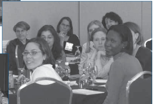
The 4 th annual Women in Thyroidology meeting brought together women at all career stages.