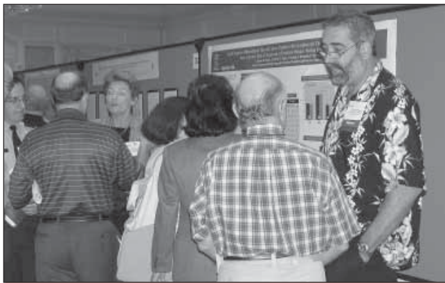
Annual Meeting attendees gather to discuss new research in thyroid diseases at the Poster Session.