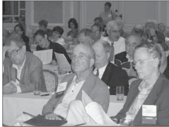
ATA members review issues on the agenda at the ATA Annual Business Meeting.