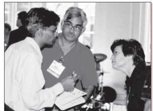
The Exhibit Hall was bustling with activity throughout the week as attendees had the opportunity to get insight on products, equipment, and other thyroid-related initiatives.

Visit www.thyroid.org to view a slide show of the meeting and streaming video of clinical sessions.