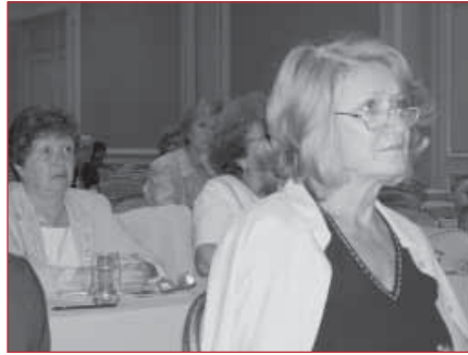
South Florida residents listen to an panel of thyroid experts and patient advocates at the free public education forum held during the Annual Meeting.