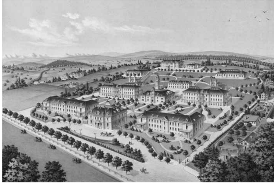
Figure 3. The University Hospital, the Inselspital , in Bern, Switzerland, in 1884.

ding member and the first president of the Swiss Society for Surgery, and he was the President of the German Society of Surgeons (1902) and the President of the First International Surgical Congress in Brussels in 1905.