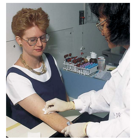
Click on Image to view full size